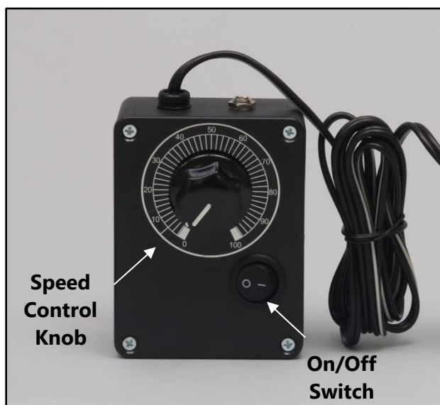
VP 710K Magnetic Tumble Stirrer Control.

The control for the Tumble Stirrer has an ON/OFF switch and a speed control knob (see photo below). Place the power switch in the ON position (press down on "I") and adjust the speed control knob to change the operating speed of the Tumble Stirrer. The speed control for the Tumble Stirrer is designed to control the speed and to gradually take the unit from the OFF position to the set speed in a gradual acceleration. The speed control knob should not be used to stop the motion of the Magnetic Tumble Stirrers. To stop the Magnetic Tumble Stirrer, always press the power switch to the OFF position ("O").